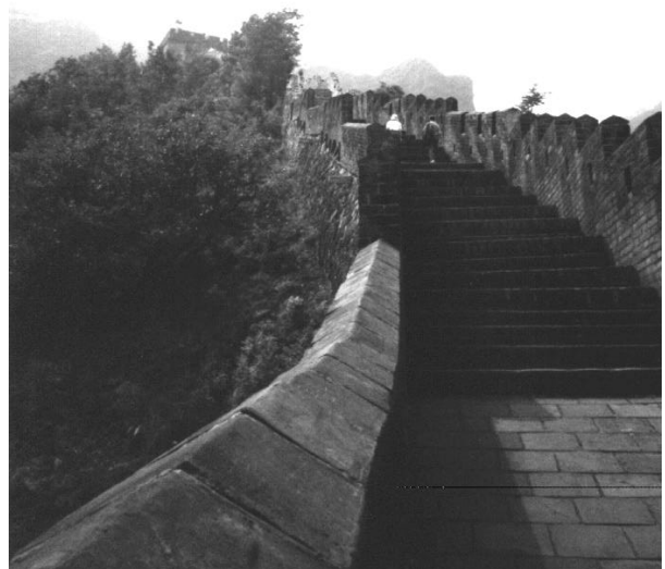
The Chinese Wall

7. The secretary reported that according to statistics from IFLA Headquarters the section had 77 members at present. The importance of active recruiting of new members was stressed in order to reach the